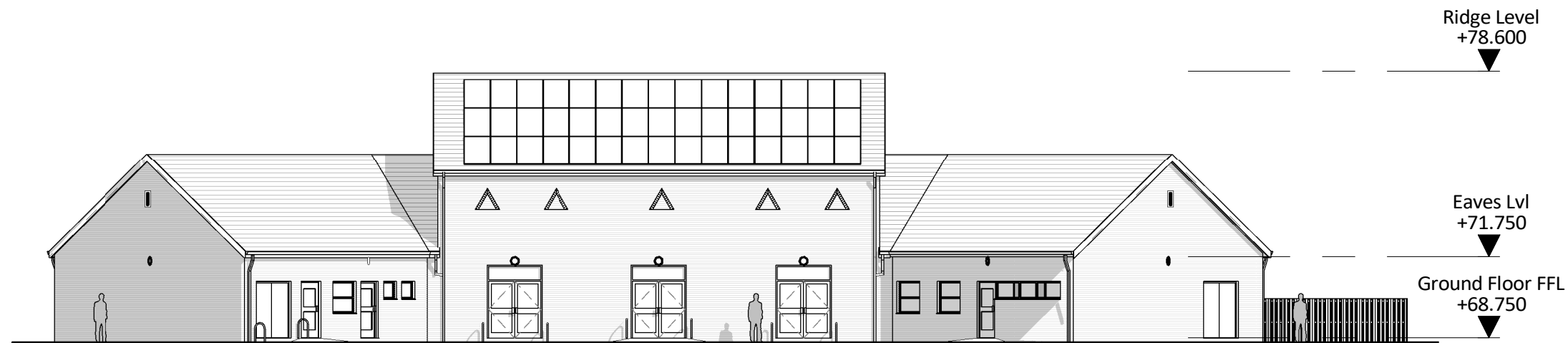
4. PROPOSED WEST (REAR) ELEVATION SCALE - 1 : 200@A3