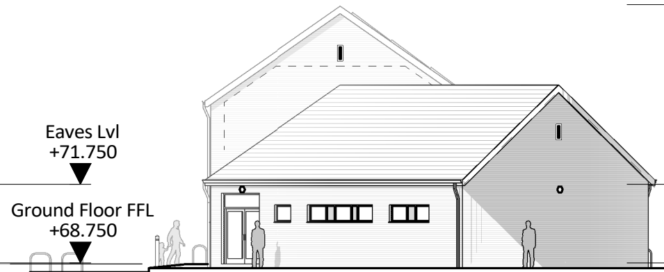
2. PROPOSED NORTH (SIDE) ELEVATION SCALE - 1 : 200@A3